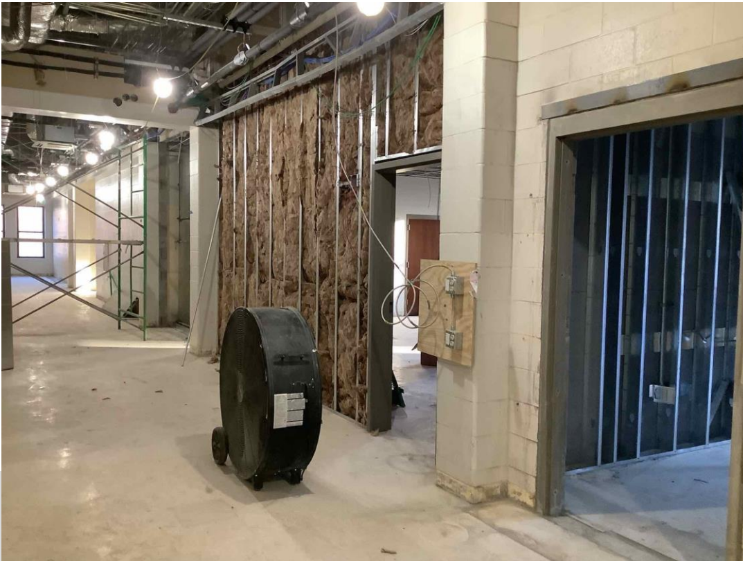
Acoustical insulation install