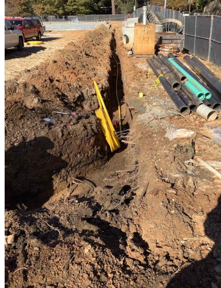
New gas line to COPS Building