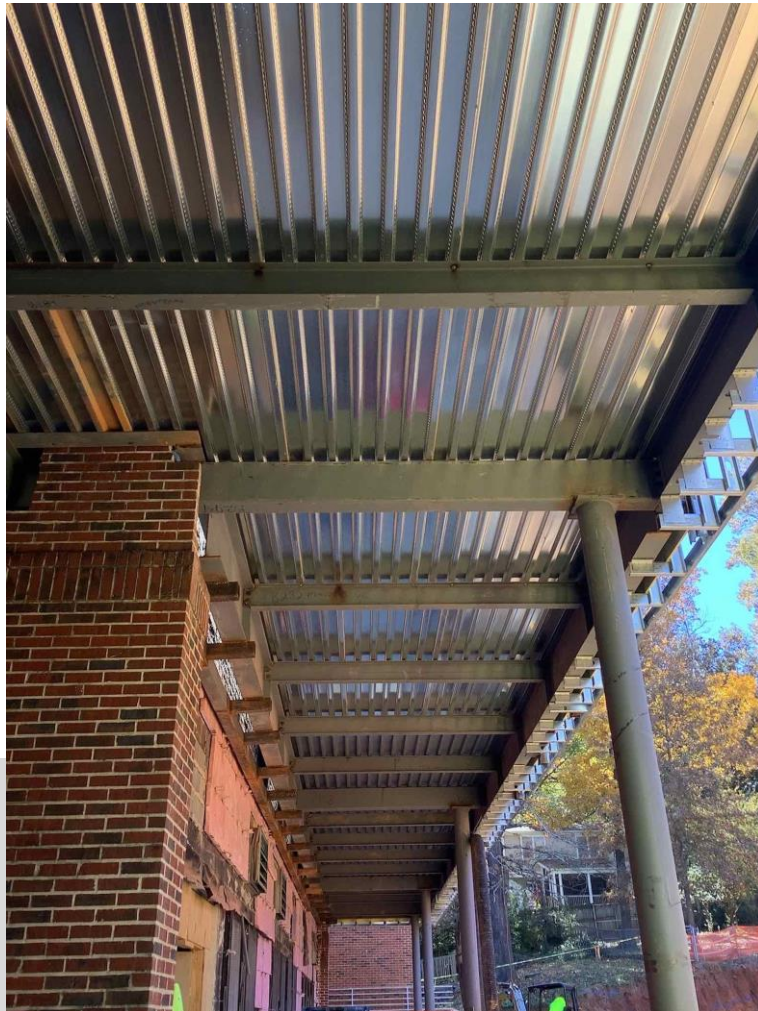
Cafeteria addition decking install