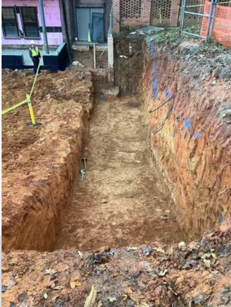
Cafeteria retaining wall install