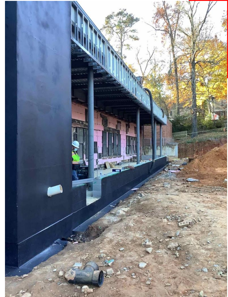
Waterproofing at cafeteria addition